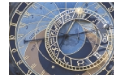
Old Town Astrological Clock

Prague is above all else a city of secrets and mysteries. Each street in the Old Town has its ghosts. Around midnight a headless knight allegedly rides on his horse in one street. Somewhere else a fiery man moves about and a woman in white walks along the walls of the castle fortifications in the light of a full moon. Author, genius of secrets of the modern world, and analyst of its relations and mechanisms, Franz Kafka , lived in this environment. The hard-working office employee absorbed the Czech, German, and Jewish soul of the city. His home was built literally on the border between two Prague quarters called the Jewish Town and Old Town. Today a small square named after the famous author and the Franz Kafka Centre occupy this site. The Centre houses Kafka's written works and the story of his life.