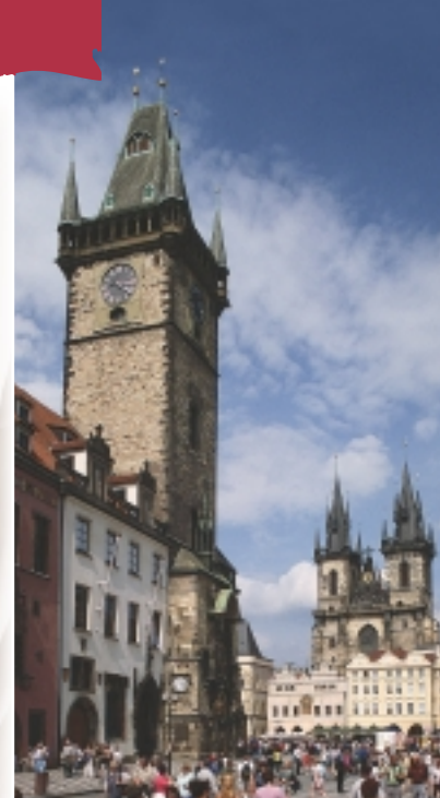
Old Town Square

The medieval Charles Bridge joins the king's Castle with the residential area, Old Town. Floods, wars, even fires have taken nothing from these sites. The cobblestones that pave the roads on which Prague citizens walk have lasted ages. In the Malá Strana area, just below the Castle, lies a Baroque town with dozens of awe-inspiring palaces, impressive churches, and picturesque, little streets. On the other side of the river sits the well-preserved Gothic Old Town with the sharp lines of its town hall and church spires and its silent little squares.