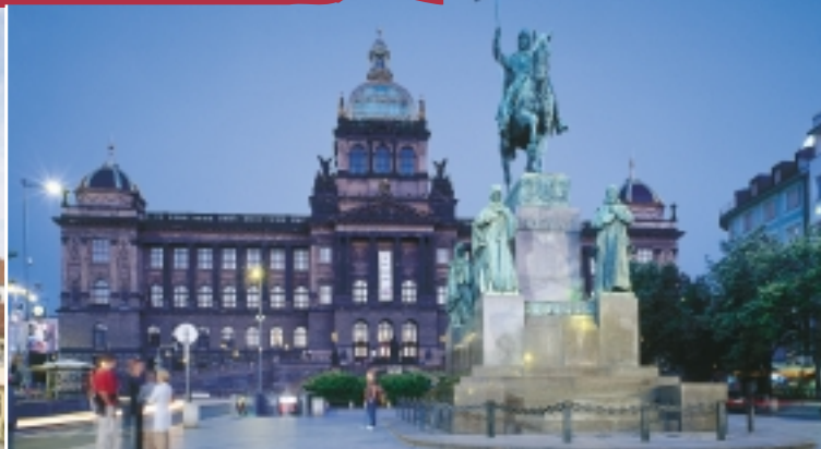
Wenceslas Square – National Museum