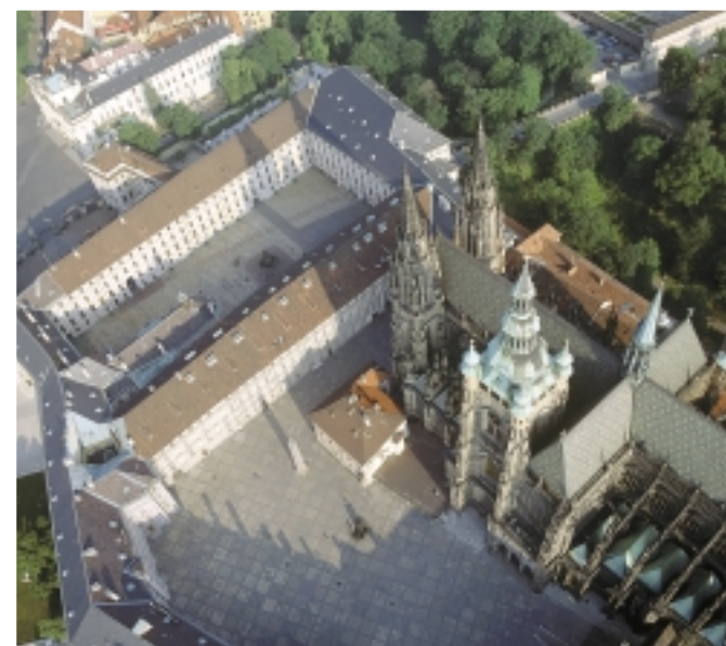
Areal view of St. Vitus Cathedral