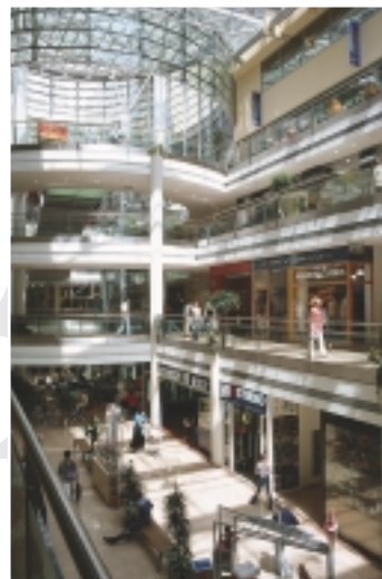
Flora Shopping Centre

People travel to Prague to explore, for the culture, for tourism ... and to shop . It's pleasant to learn that brand name goods are somewhat cheaper here than in many other West European cities. Dozens of large shopping centres are open 24 hours ; others close as late as a couple of hours after midnight. Prague's historic centre includes occasional and daily open-air markets with artwork, wooden toys and souvenirs. Cut glass , painted porcelain , and precious stones including Czech garnets remain quality, time-tested, typical Czech goods.