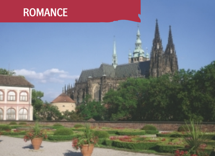
Prague Castle Gardens