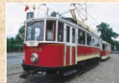
Historic Streetcar / Tram